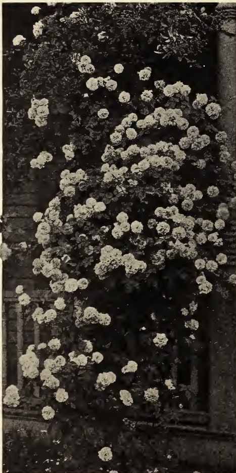
Dorothy Perkins Climbing Rose